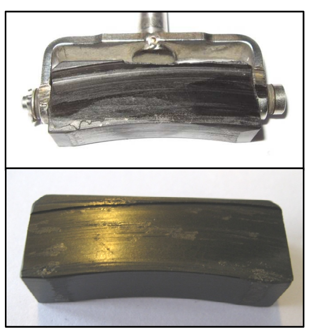
FIGURE 1: Excessive wearing of the carbon block